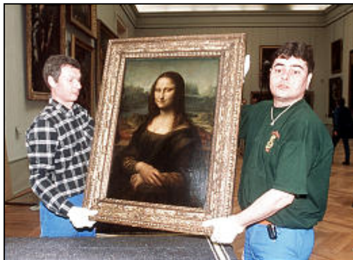
Employees of the Louvre hold the "Mona Lisa" in the museum.